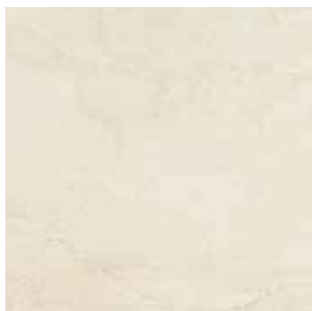
CREST SC01 - UNPOLISHED