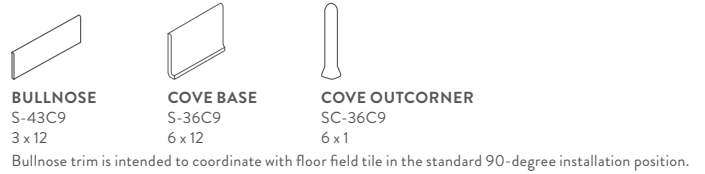
BULLNOSE S-43C9 3 x 12