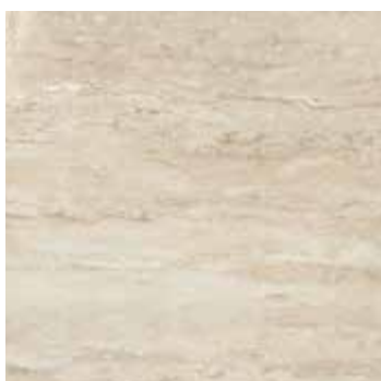
SHORE SC02 - LIGHT POLISHED