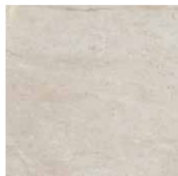
HORIZON SC04 - LIGHT POLISHED