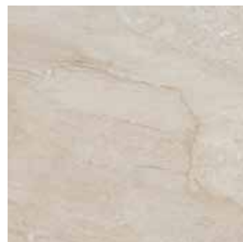
HORIZON SC04 - UNPOLISHED