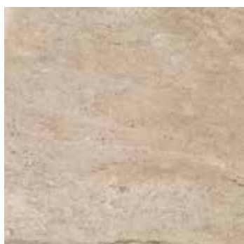
RIDGE SC03 - LIGHT POLISHED