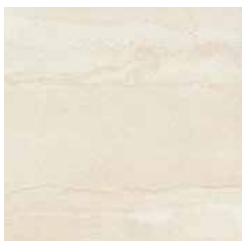
CREST SC01 - LIGHT POLISHED