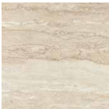
SHORE SC02 - UNPOLISHED