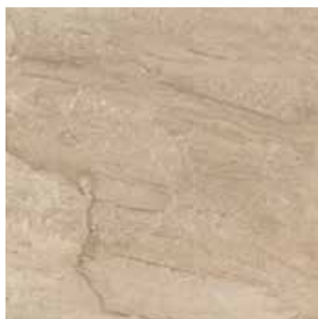
RIDGE SC03 - UNPOLISHED