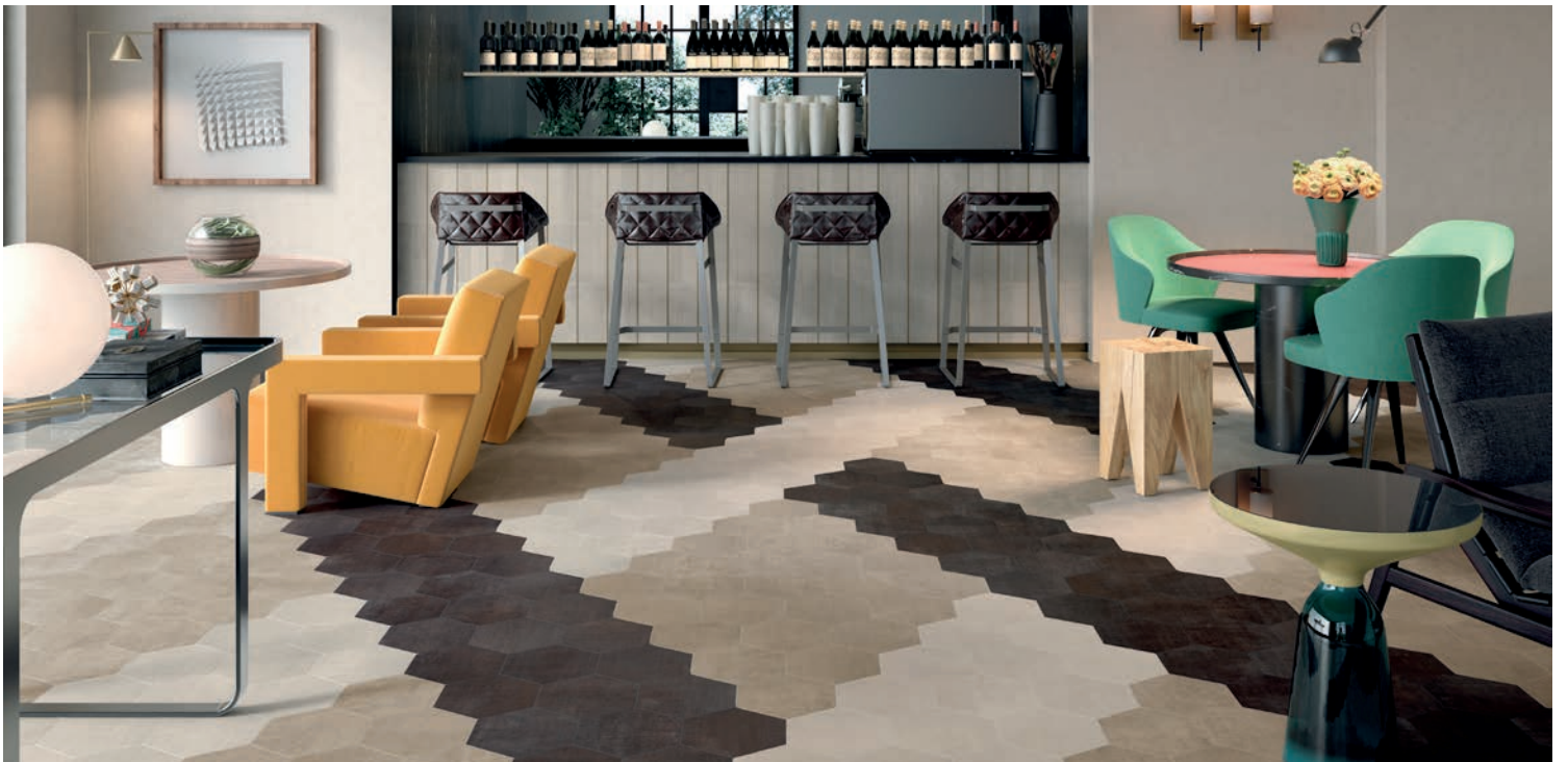
IVORY, SAND & DARK