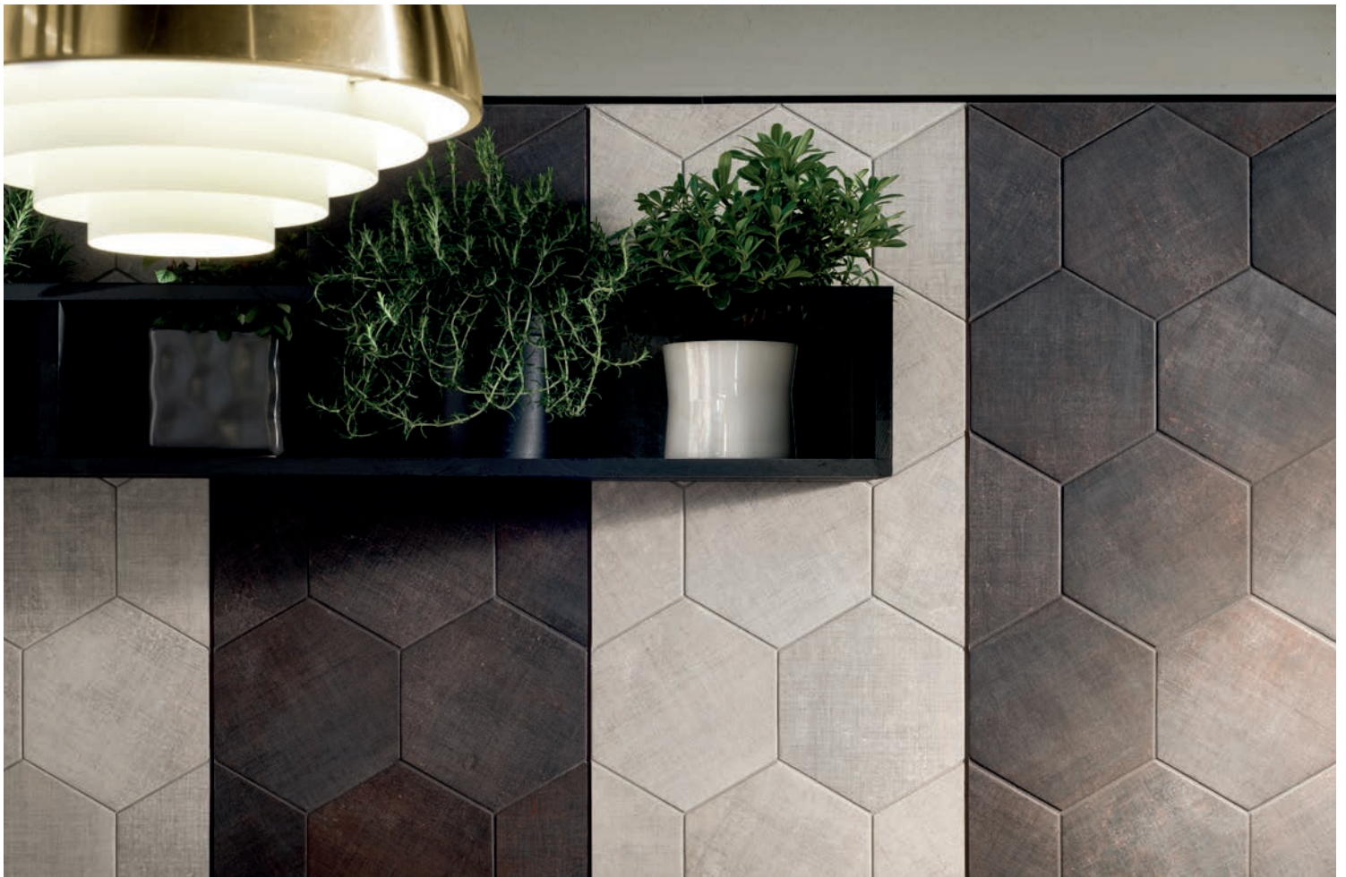
SILVER & DARK