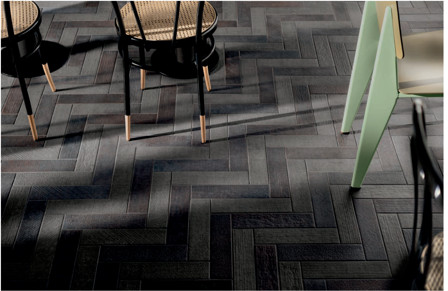
TAUPE & DARK