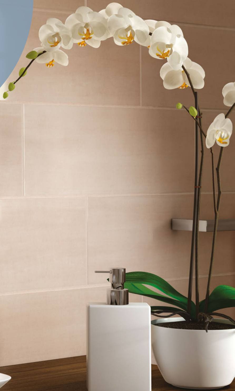
Photo features Horizon Taupe 6 x 16 wall tile on the wall.

Soft linear graphics imitate the sweeping strokes of watercolors in the Horizon collection by American Olean®. Available in four neutral hues and a large format linear design, this elegant series can be used as a dramatic feature wall or a striking accent to add subtle depth and dimension to any design vision.