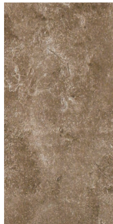
30 x 60 cm (12 x 24) UI.BZ.CNR.1224

All items shown in this document are part of Olympia's stocking program. For special orders, please contact your Olympia Tile Sales Representative.