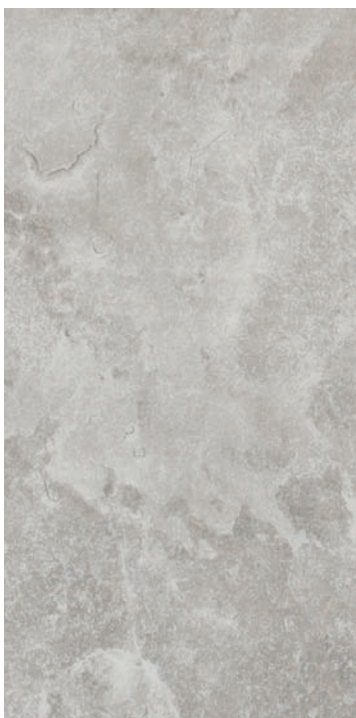
30 x 60 cm (12 x 24) UI.BZ.GRG.1224