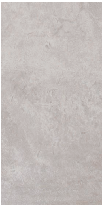
30 x 60 cm (12 x 24) UI.BZ.BIA.1224