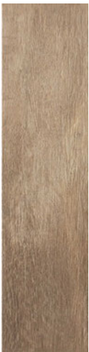
CH07 Divinity 9"x36"