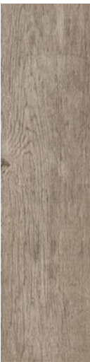
CH06 Tranquility 9"x36"