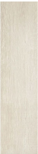
CH05 Purity 9"x36"