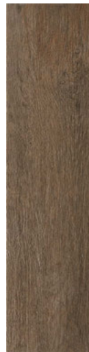
CH08 Nobility 9"x36"