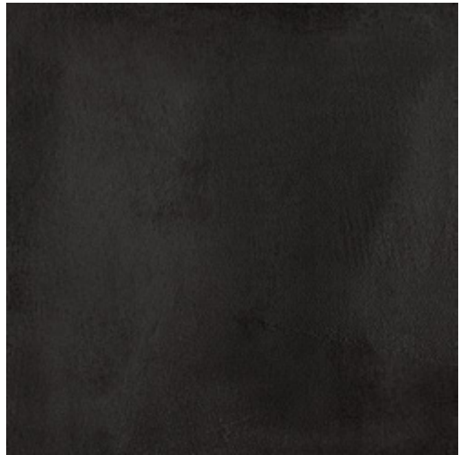
18.6 x 18.6cm (7.32 x 7.32) Matte Finish GW.MK.ATR.0808.MT

All items shown in this document are part of Olympia's stocking program. For special orders, please contact your Olympia Tile Sales Representative.