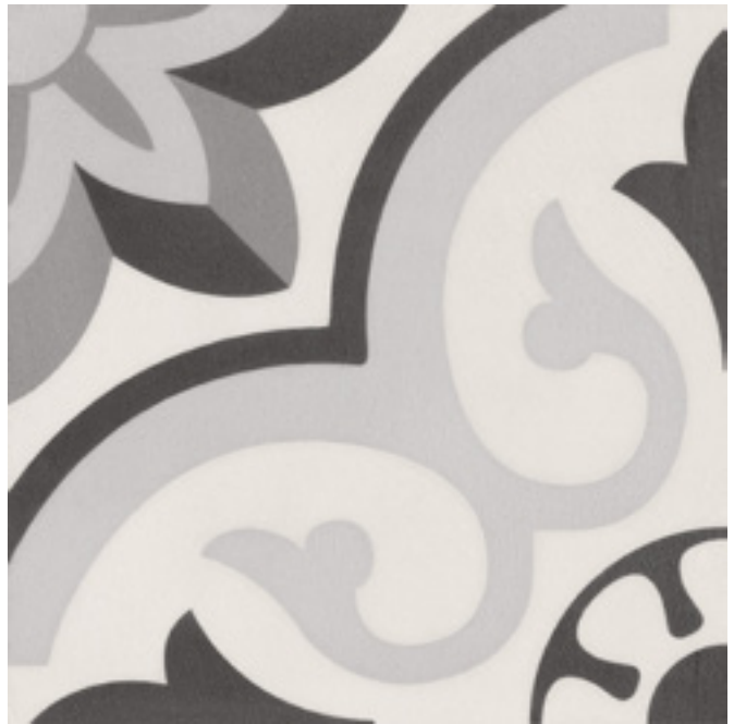
18.6 x 18.6cm (7.32 x 7.32) Matte Finish GW.MK.MX2.0808.MT.DC

All items shown in this document are part of Olympia's stocking program. For special orders, please contact your Olympia Tile Sales Representative.