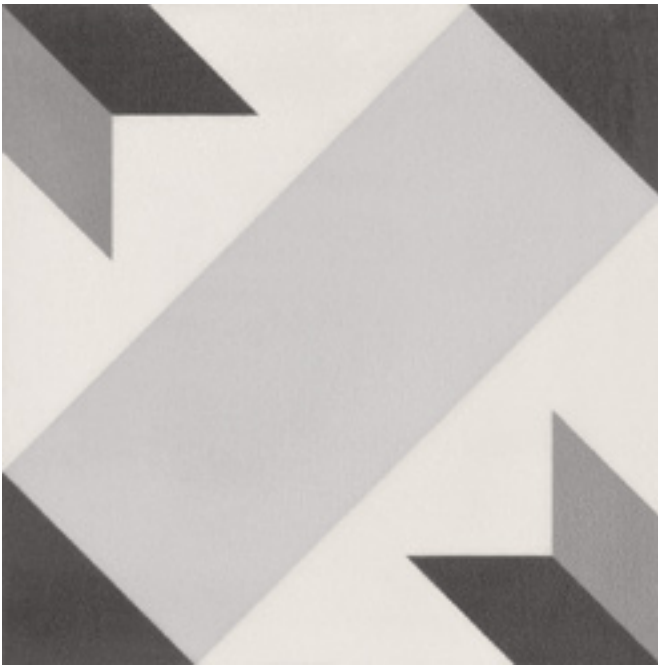
18.6 x 18.6cm (7.32 x 7.32) Matte Finish GW.MK.MX1.0808.MT.DC