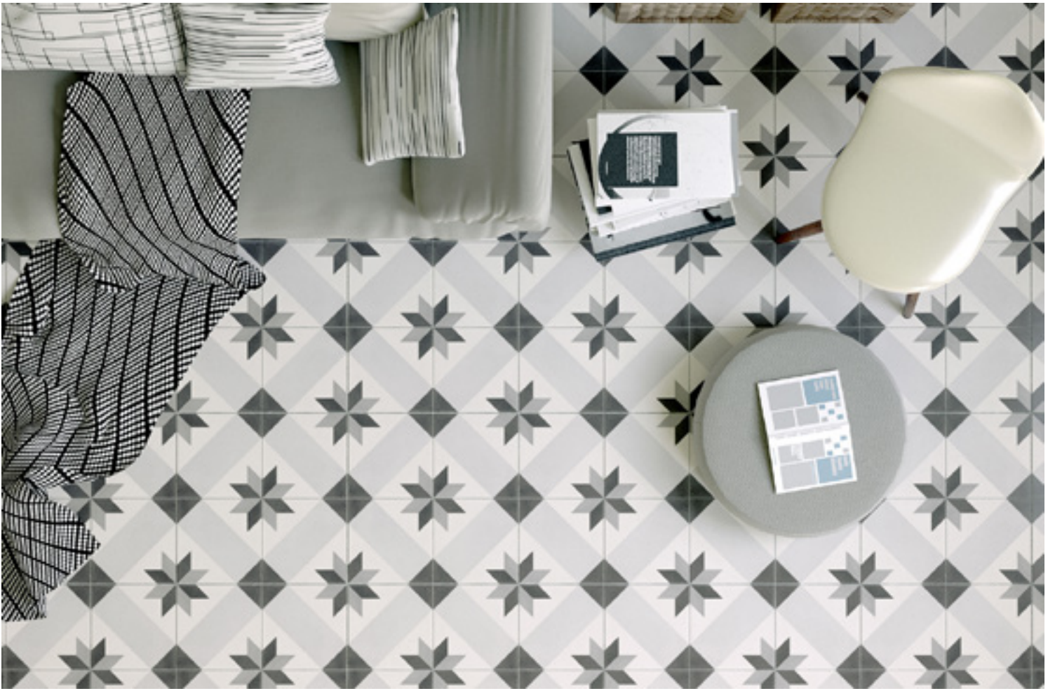
Decor MIX 1