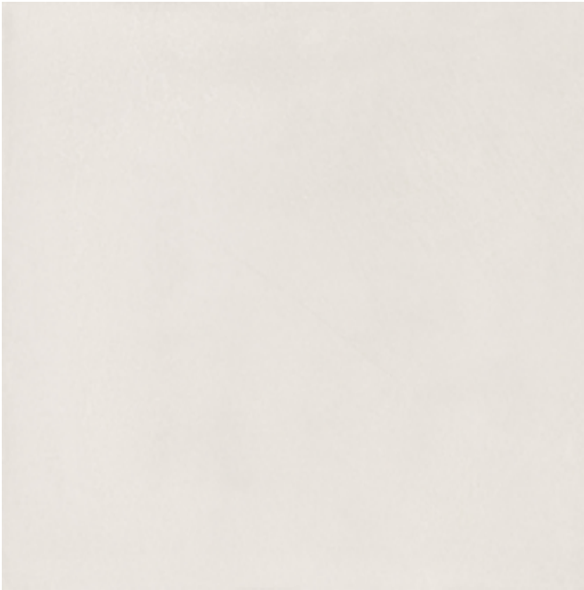
18.6 x 18.6cm (7.32 x 7.32) Matte Finish GW.MK.IVO.0808.MT