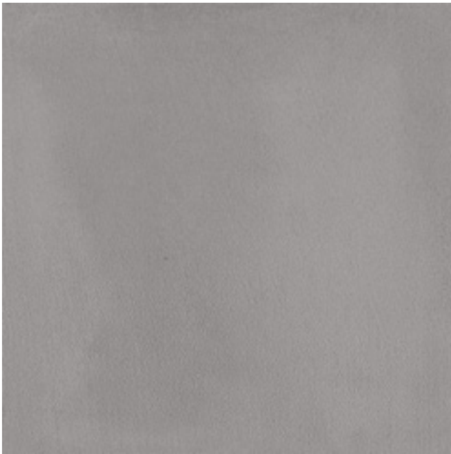
18.6 x 18.6cm (7.32 x 7.32) Matte Finish GW.MK.GRY.0808.MT