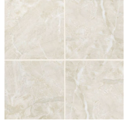
SILVER MARBLE ML72