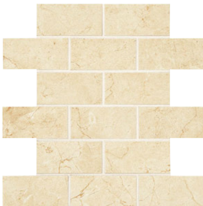
CREMA LAILA ML71