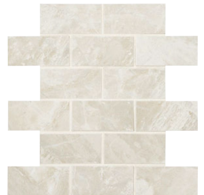
SILVER MARBLE ML72