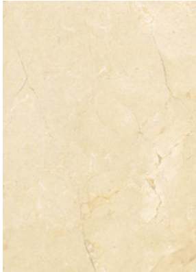
CREMA LAILA ML71