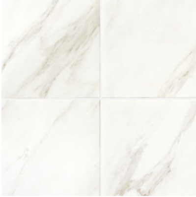
BIANCO CARRARA ML70