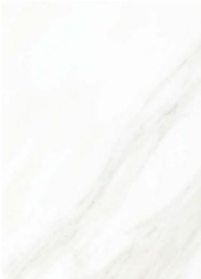
BIANCO CARRARA ML70