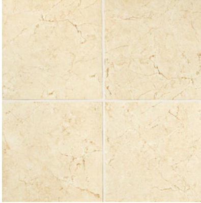
CREMA LAILA ML71