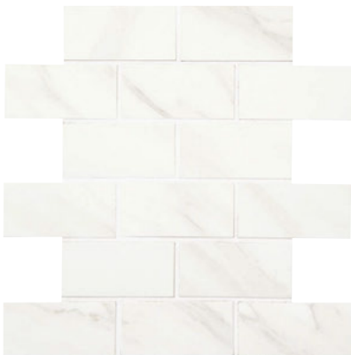
BIANCO CARRARA ML70