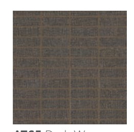
AT65 Dark Weave