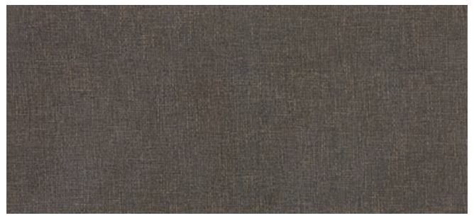
AT65 Dark Weave