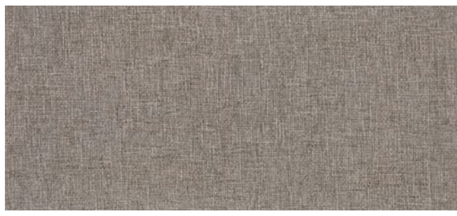
AT64 Woven Slate