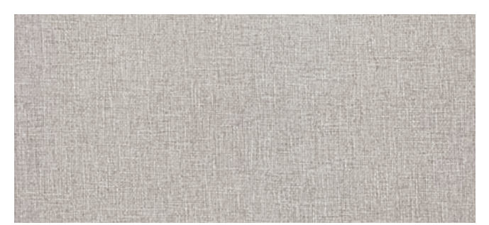
AT63 Light Thread