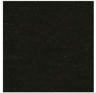
FUTURISTIC BLACK UM10