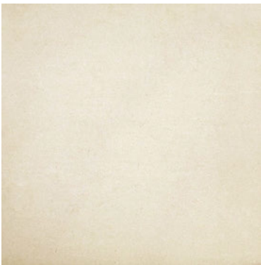
INFINITE CREAM UM05