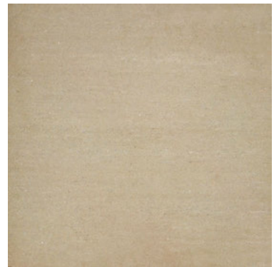
PROGRESSIVE GRAY UM07