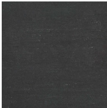
ADVANCED CHARCOAL UM09