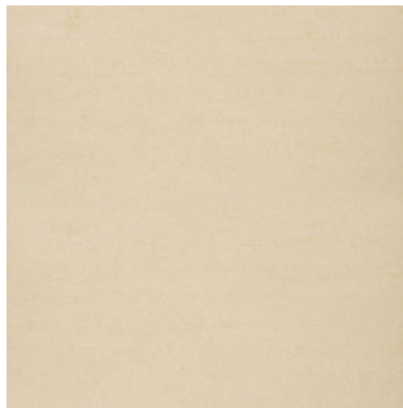
BEYOND BEIGE UM06