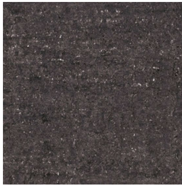
ADVANCED CHARCOAL UM09