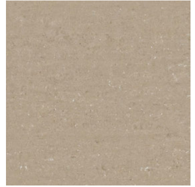
PROGRESSIVE GRAY UM07