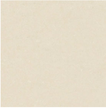
INFINITE CREAM UM05