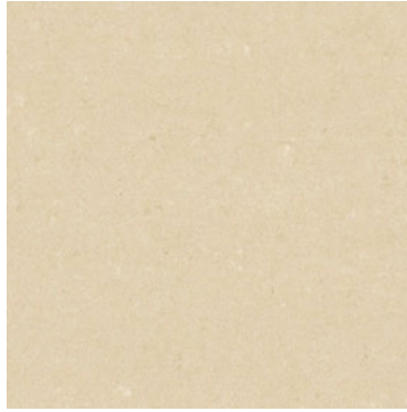
BEYOND BEIGE UM06