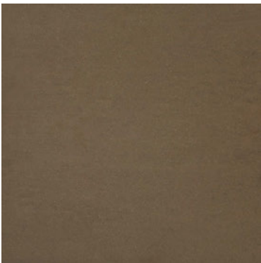
VISIONARY BROWN UM08