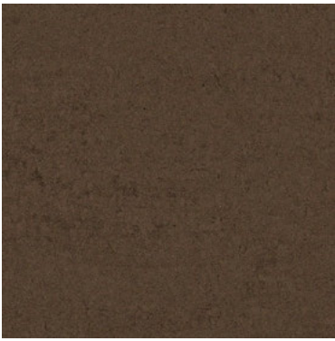
VISIONARY BROWN UM08