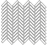
HERRINGBONE GLASS & STONE MOSAIC ■ (11-1/2" x 12-3/4" Sheet) (29.21 cm x 32.39 cm Sheet)