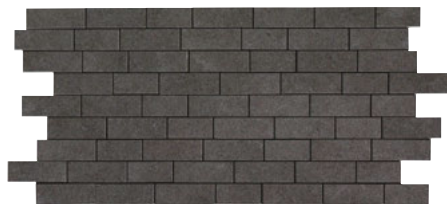
EXACT BLACK RL05