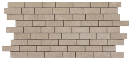
TIMELY BEIGE RL02