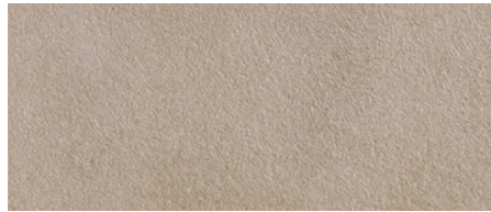
TIMELY BEIGE RL02