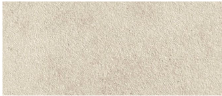
CONTEMPORARY CREAM RL01