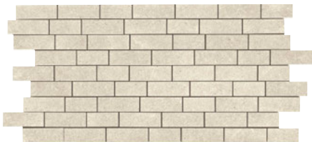
CONTEMPORARY CREAM RL01