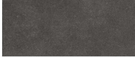
EXACT BLACK RL05