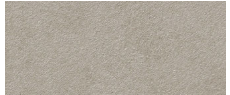
GERMANE GRAY RL03