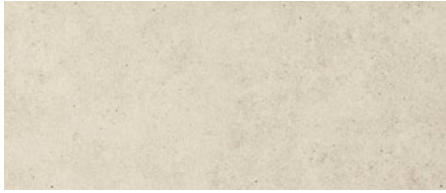
CONTEMPORARY CREAM RL01