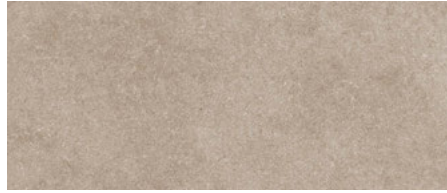
TIMELY BEIGE RL02