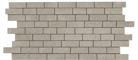
GERMANE GRAY RL03