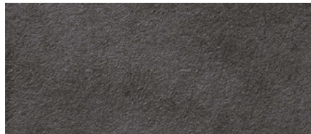
EXACT BLACK RL05