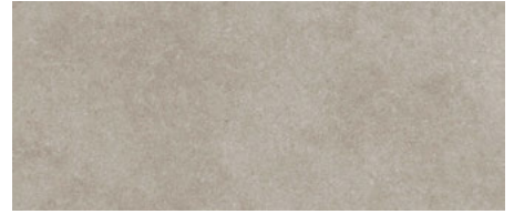
GERMANE GRAY RL03