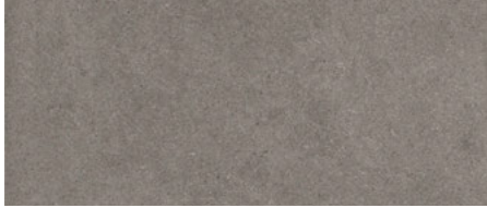
ESSENTIAL CHARCOAL RL04