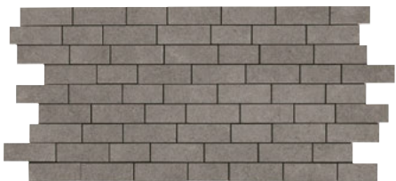
ESSENTIAL CHARCOAL RL04