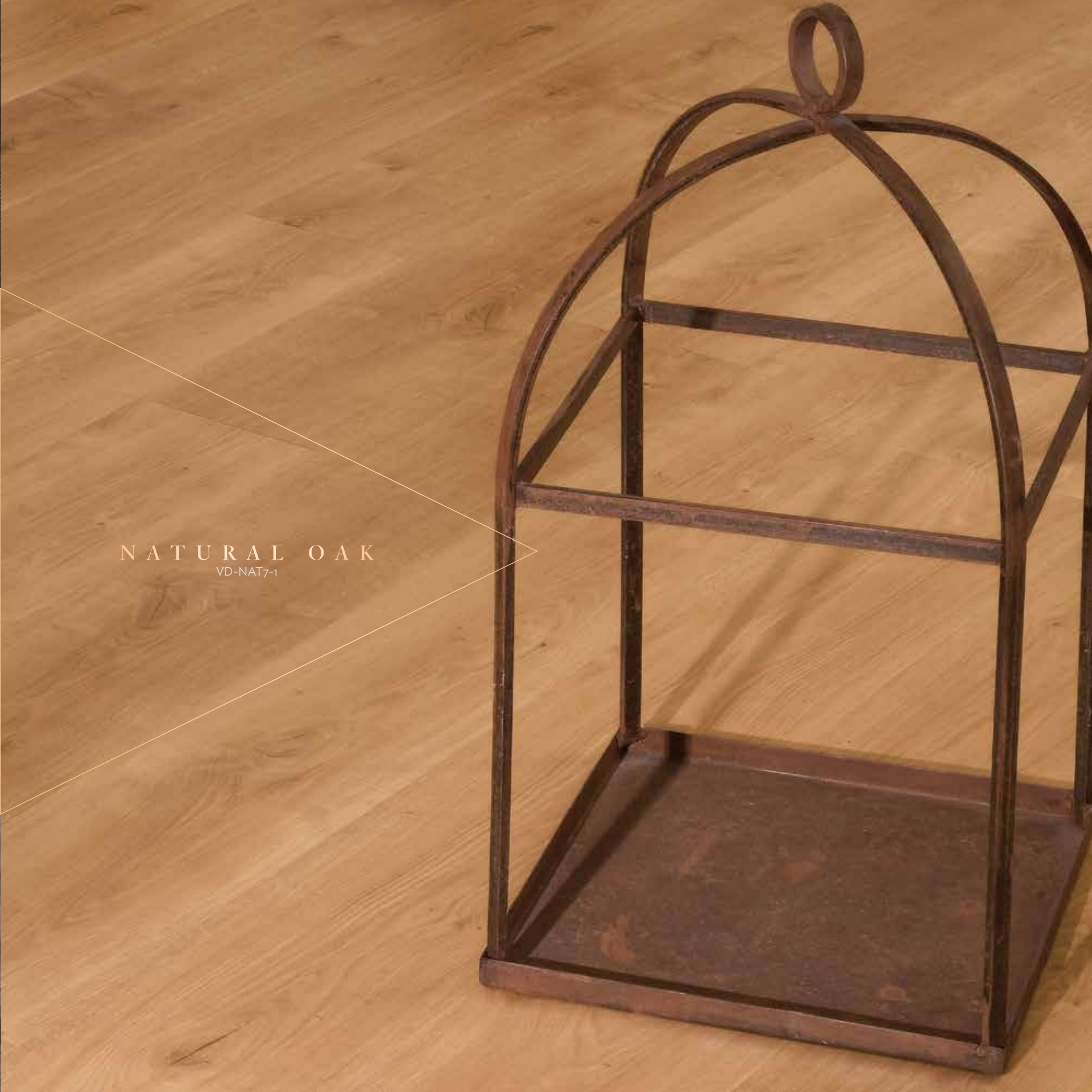
NATURAL OAK VD-NAT7-1