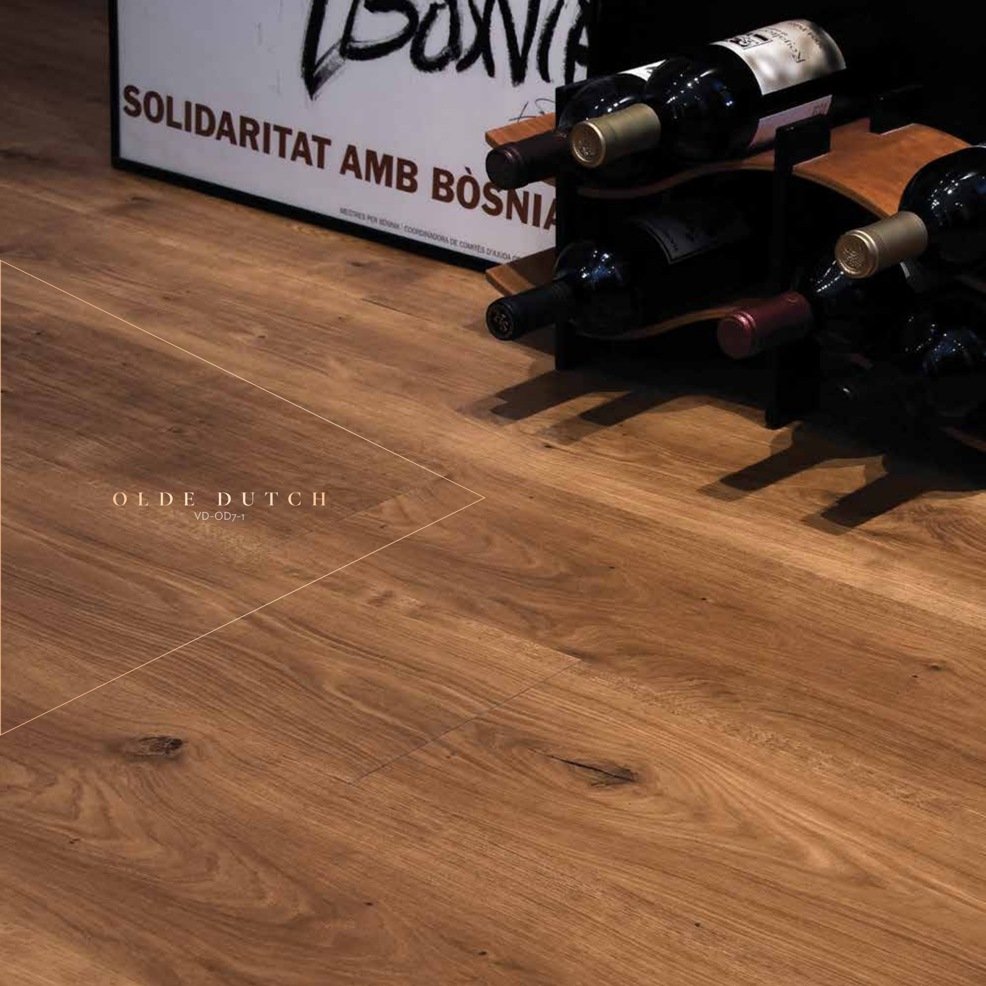
OLDE DUTCH VD-OD7-1