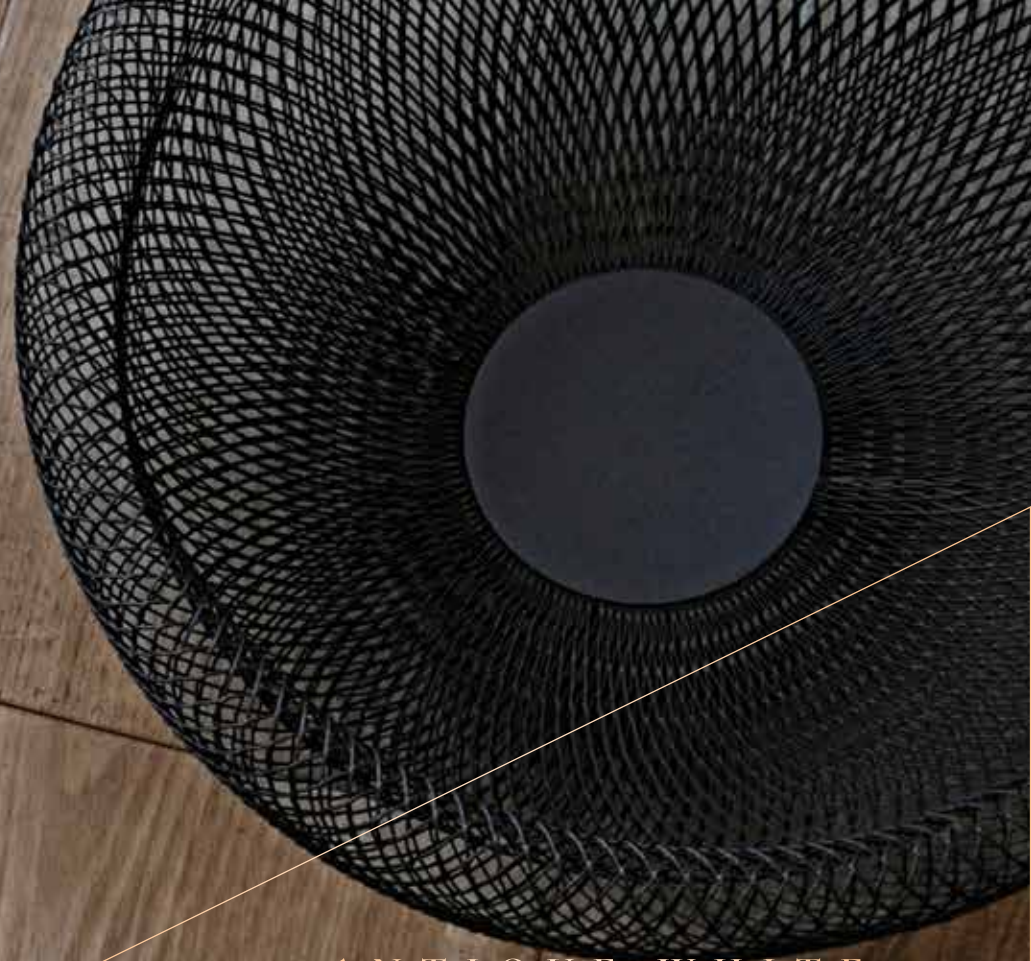
ANTIQUÉ WHITE VD-AWH7-1